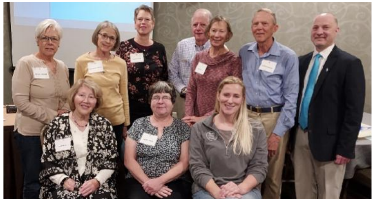
Some of the conference attendees from Missouri.